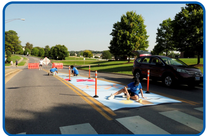
Kate Collins Middle School in Waynesboro used a QuickStart mini-grant to perform some tactical urbanism in their school community.

The term “match” is often used in the context of grant funding. It refers to the share of funding that a grant applicant is required to provide as part of the grant agreement. For example, most federal grants for transportation projects require a 20% match from the applicant. This means the applicant must pay for 20% of the project, while the remaining 80% is paid for with federal funds.