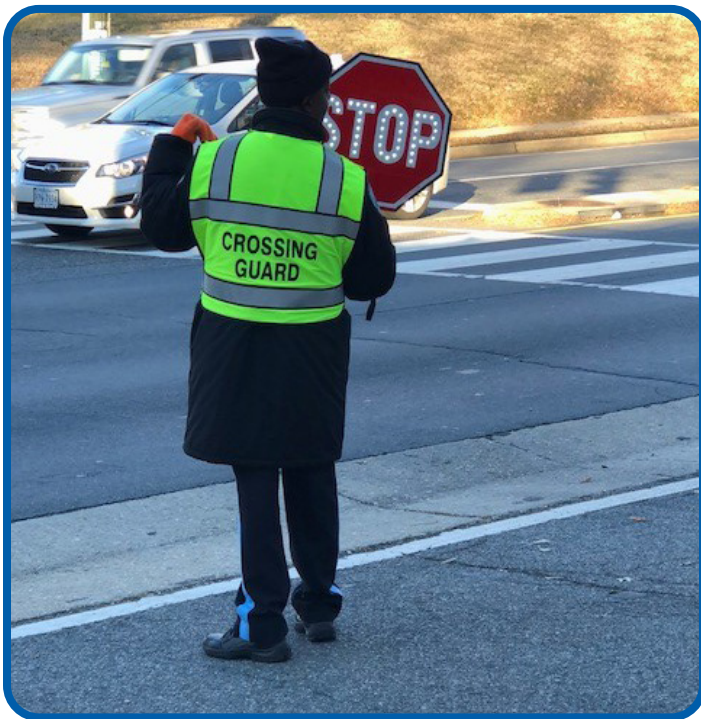
The Arlington County Police Department used a QuickStart mini-grant to get reflective stop signs for school crossing guards.